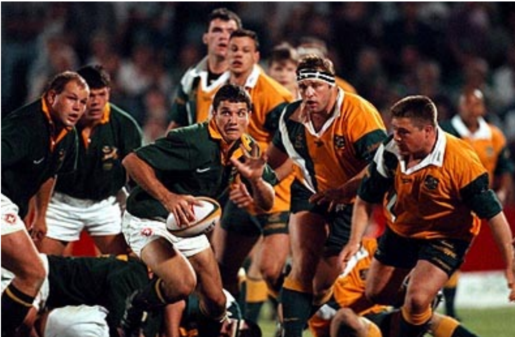
Figure 1. A rugby team also uses Scrum Meetings (not shown here).

Each Sprint operates on a number of work items called a Backlog . As a rule, no more items are externally added into the Backlog within a Sprint . Internal items resulting from the original pre-allocated Backlog can be added to it. The goal of a Sprint is to complete as much quality software as possible, but typically less software is delivered in practice ( Worse Is Better pattern). The end result is that there are non-perfect NamedStableBases delivered every Sprint .