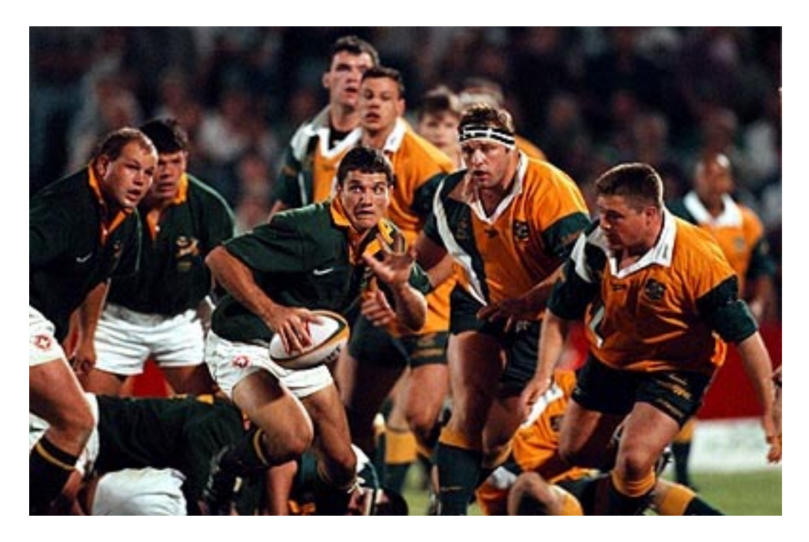
Figure 1. A rugby team also uses Scrum Meetings (not shown here).

Each Sprint operates on a number of work items called a Backlog . As a rule, no more items are externally added into the Backlog within a Sprint . Internal items resulting from the original pre-allocated Backlog can be added to it. The goal of a Sprint is to complete as much quality software as possible, but typically less software is delivered in practice ( Worse Is Better pattern). The end result is that there are non-perfect NamedStableBases delivered every Sprint .